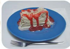
LASAGNA ICE CREAM

Aren't you a little curious? Wouldn't you like to try a Spaghetti Ice Cream or a Lasagna Ice Cream right now? Your customer will feel the same way.