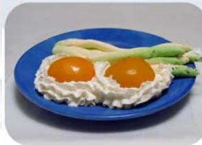
ASPARAGUS ICE CREAM

Aren't you a little curious? Wouldn't you like to try a Spaghetti Ice Cream or a Lasagna Ice Cream right now? Your customer will feel the same way.