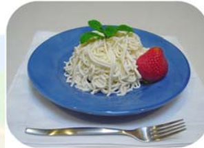
SPAGHETTI ICE CREAM

When you purchase the Spaghetti Ice Cream Maker, you can select a different mold such as the Lasagna or Asparagus mold to make these delicious treats too.